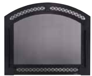
Chateau Deluxe Front