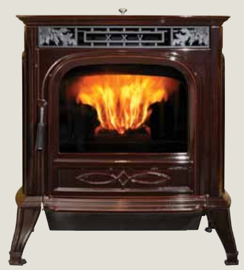
XXV shown with optional Majolica Brown enamel

The XXV has a remarkably precise temperature control system built right in so you won't need an old-fashioned thermostat. The Harman XXV constantly monitors room temperatures and makes automatic adjustments to the pellet feed rate and combustion air so you get very even heating. It even turns off and on as needed. Your home is kept warm and comfortable without the rapid fluctuations in temperatures common to other pellet stoves. The XXV is so advanced it will keep the room temperature just where you want it, regardless of the quality of pellets you burn or the frequency you clean your stove.